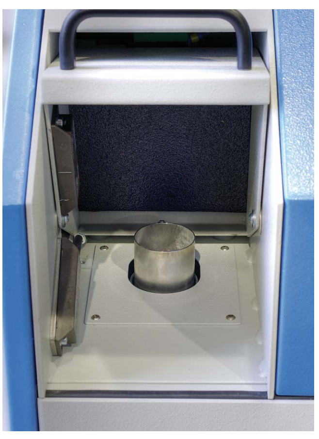
Separate sample output position

After grinding, the sample material is filled into a stainless steel cup and can be removed at once at the output position during the cleaning of the vessel.