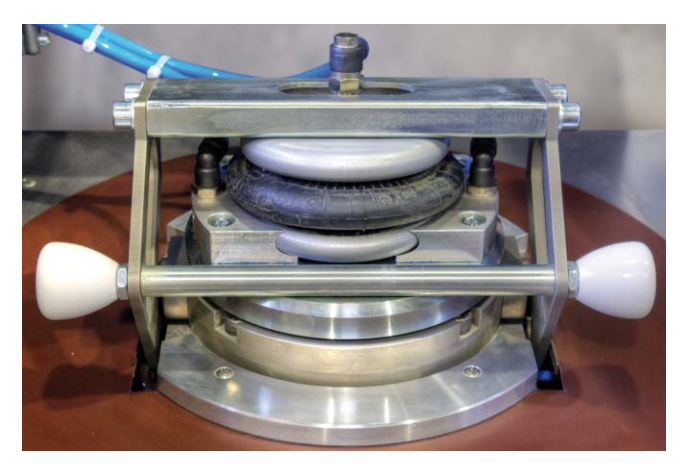
Pneumatic locking of the grinding vessel