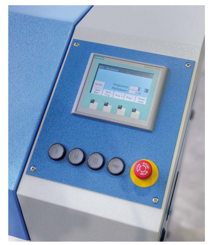
Touch screen operating panel

All parameters for grinding duration and grinding speed, as well as for sample output and cleaning are deposited as program parameters and can be set at the control panel.