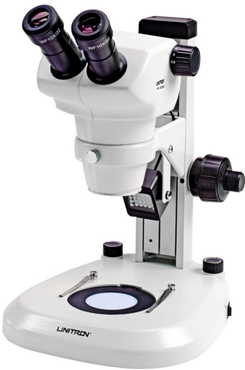
Z850 with LED stand and integrated LED illumination (CAT# 13101)

A wide range of stands and illumination options are available to meet the needs of any application. UNITRON offers plain focusing stands, LED stands, boom stands, articulating (flex) arm stands, pole stands, diascope illumination stands, plus a variety of LED ring lights and fiber optic illuminators.