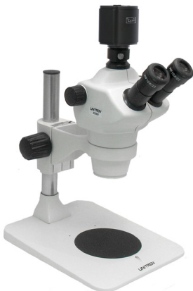
Trinocular Z850 with pole stand (CAT# 13134) and Excelis™ HD camera (CAT# AU- 600-HD)