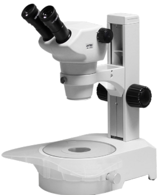
Z850 with diascope stand and integrated LED illumination (CAT# 13110)