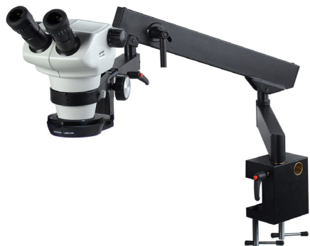
Z850 with flex arm stand and LED ring light (CAT# 13107-2)