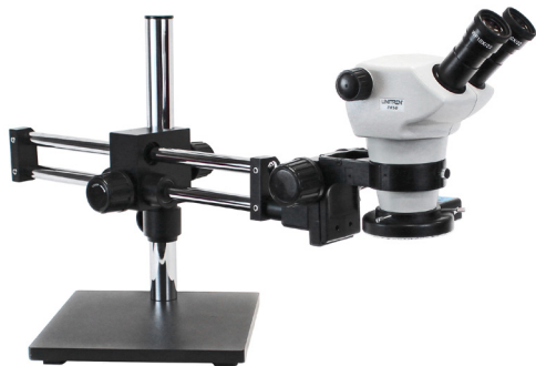
Binocular Z850 with ball bearing boom stand and quad LED ring light (CAT# 13106-1)