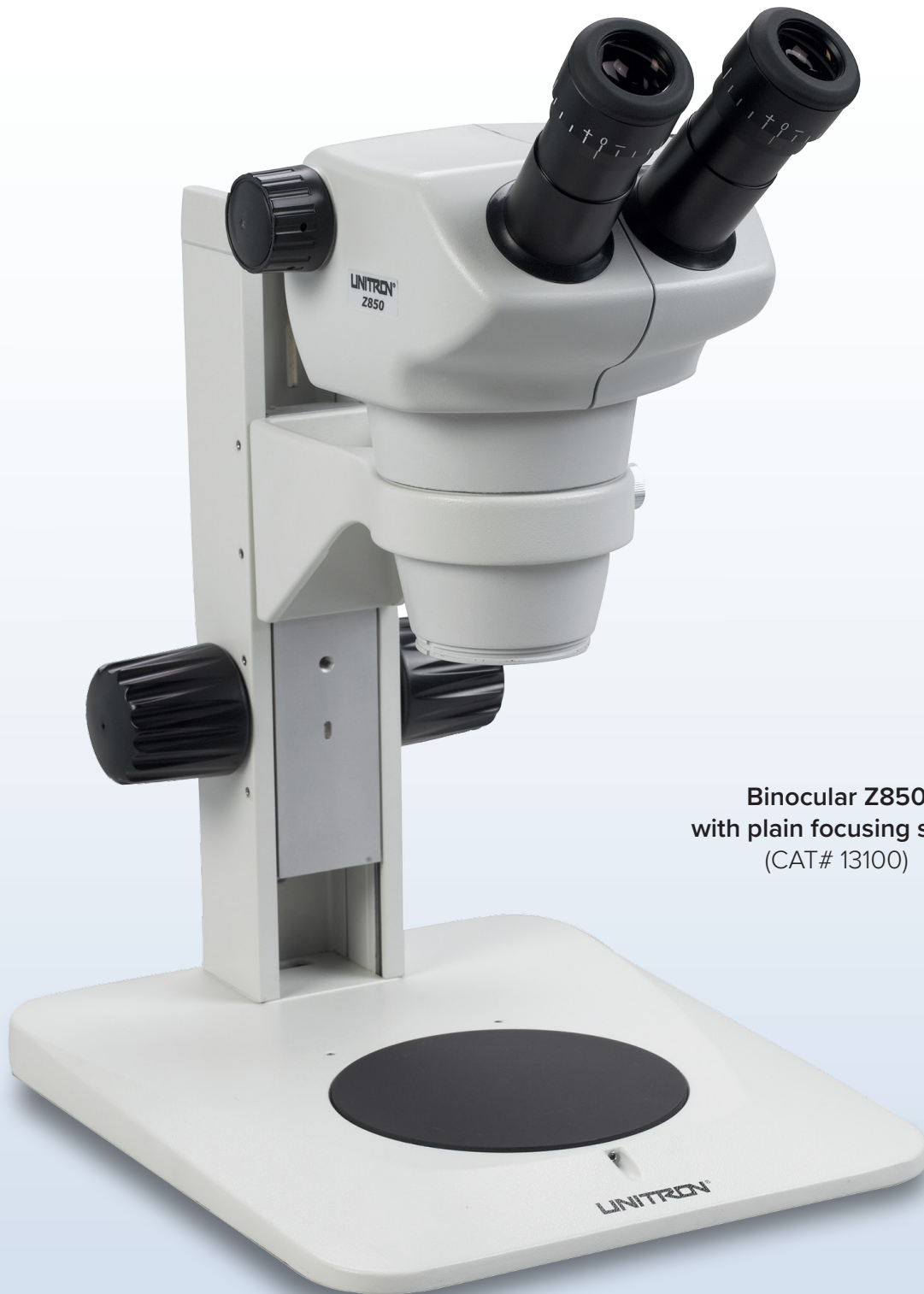
Binocular Z850 with plain focusing stand (CAT# 13100)