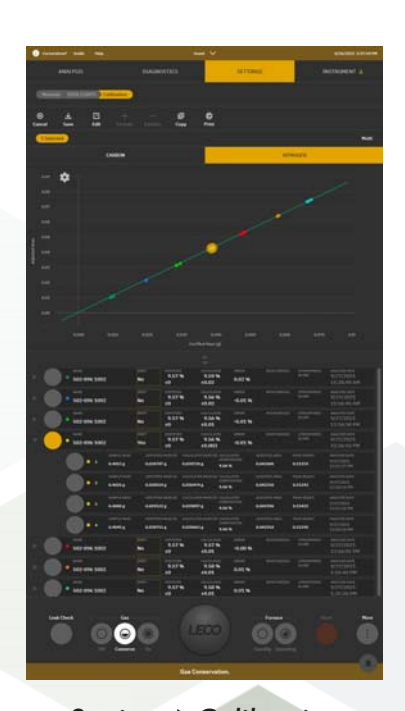
Settings ► Calibration