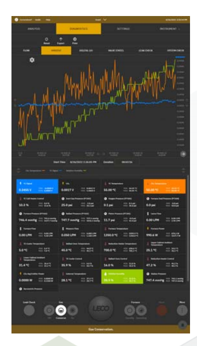
Diagnostics ► Ambients

Cornerstone also supports a multilingual interface, user permissions, extended data archiving and filtering, compatibility with various Laboratory Information Management Systems (LIMS), and flexible reporting capabilities. Compliance to FDA regulations 21 CFR Part 11 for a closed analytical system is also supported.